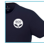
MATERIAL Branded organic cotton garment