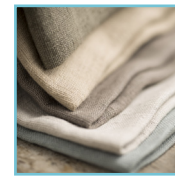
MATERIAL Dyed & finished fabric