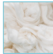
MATERIAL Cotton fiber