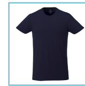
MATERIAL Dyed & finished fabric