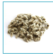
MATERIAL Organic cotton seeds/fiber bales